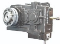
Shaft Mounted - L Type Bevel Helical Gearbox