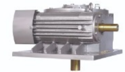
Heavy Duty - Worm Vertical Gearbox