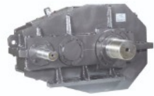
Helical Crane Duty Gearbox