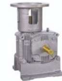
Worm - Input Vertical Gearbox