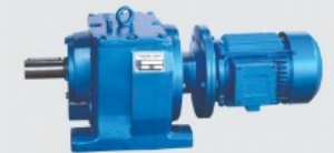
Helical Geared Motor