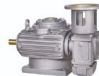
Worm Vertical Double Reduction Gearbox