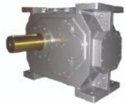
Helical Gearbox Custom Built