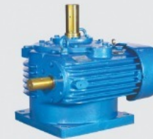
Worm Vertical Gearbox