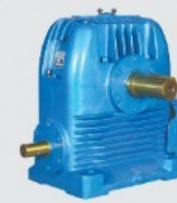
Worm Horizontal Gearbox