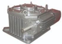
Worm Vertical -Heavy Duty Stirrer Gearbox