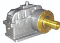
Helical Extruder With Solid Shaft