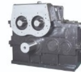
Helical - Triple Output Gearbox