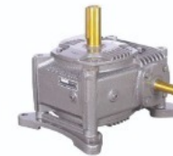
Worm Adaptable Vertical Gearbox