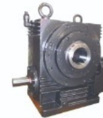
VNU Worm Gearbox