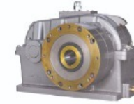
Helical Extruder Gearbox