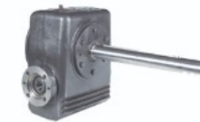
Worm Input Hollow - Extra Length Output Shaft