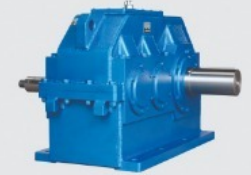
Helical - Two Stage Gearbox