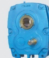
Shaft Mounted Helical Gearbox