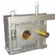
Shaft Mounted Helical Gearbox Custom built