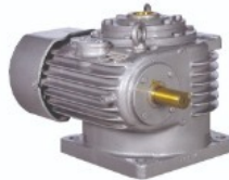
Worm Vertical - Output Hollow Gearbox