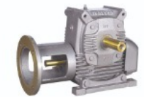
Worm Gearbox With Motor Mounting Flange