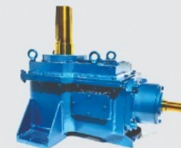
Cooling Tower Gearbox