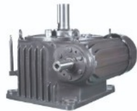
Worm Vertical Gearbox