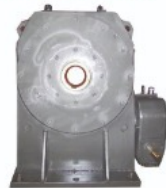
Worm Heavy Duty Double Reduction Gearbox