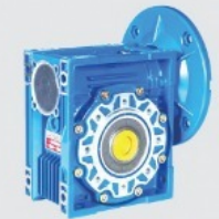
Aluminium - Worm Gearbox