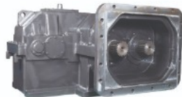
Helical - Twin Output Gearbox