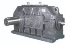
Bevel Helical Gearbox