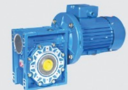
Aluminium - Worm Geared Motor