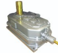
Bevel Helical Vertical Gearbox