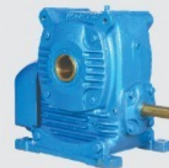
Worm - Hollow Output Gearbox