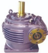
Worm Vertical Input Hollow Gearbox